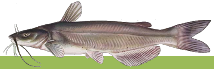
Channel Catfish ( Ictalurus punctatus )